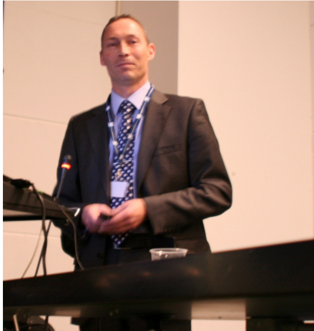
Opening ceremony keynote address: Reducing vulnerability through multi-national collaboration, by Commander SG Stein Olav, Royal Norwegian Navy