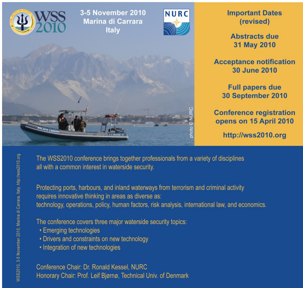
Figure 2: Front (upper) and back (lower) of WSS2010 “postcard” distributed early to advertise the conference.